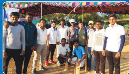
Winners, MCM Cup 2020 organised by MCM First Grade College, Mysuru