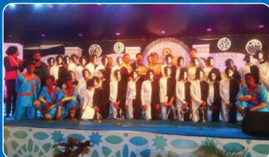
Yuva Sambrama and Yuva Dasara 2019