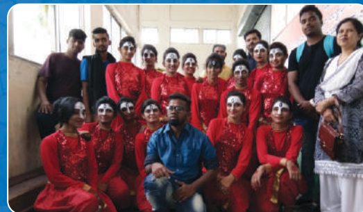
Third Place in State Level Dance Competition, Frekerzz Dance Academy, Mysuru